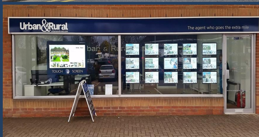
Blue on White or White on Blue... brand rules to fit every location